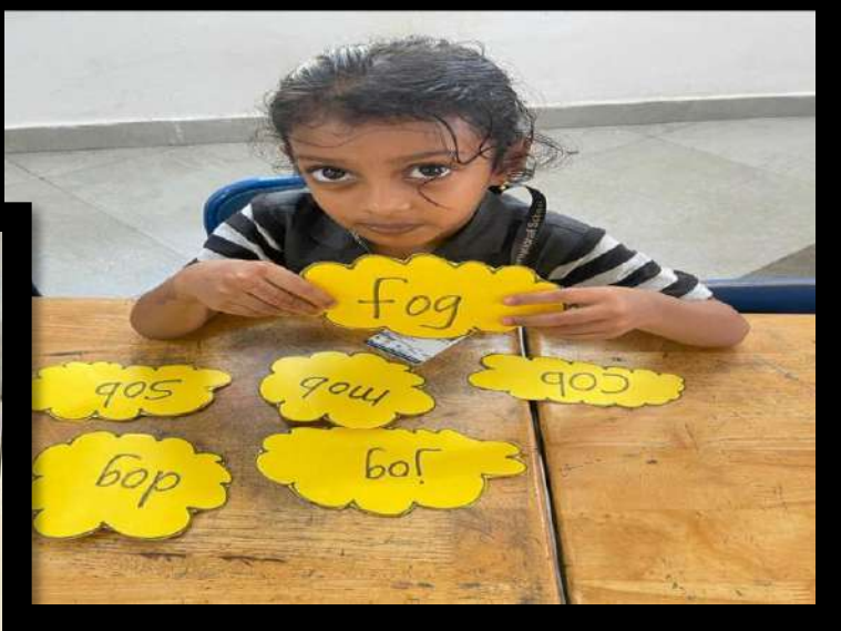
Reading CVC words