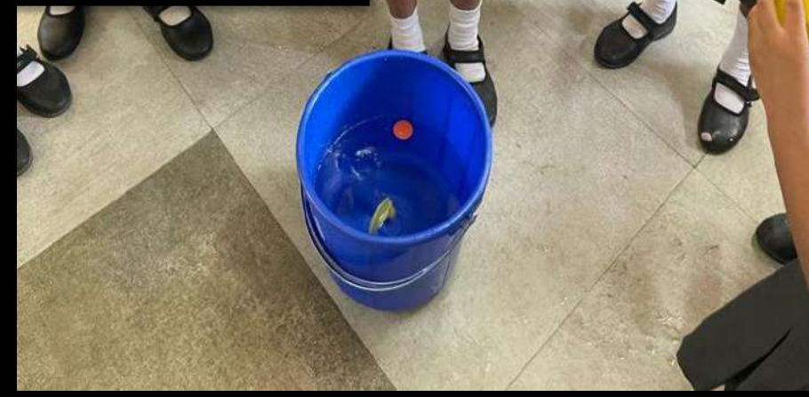
Sink and float activity