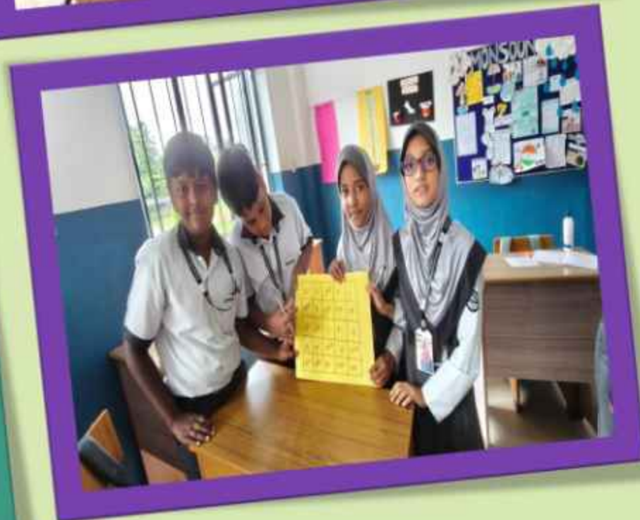
Grade 5, Exploring Roman Numerals.