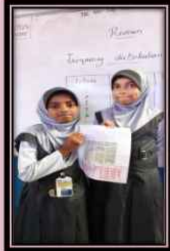
Grade 6 learners, explored real life data and represented it using tally marks.